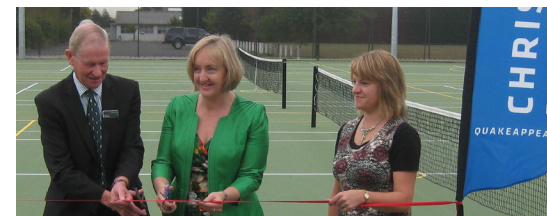
Hon Amy Adams, MP for Selwyn (centre) officially opened six courts at Lincoln's Selwyn Netball Centre last month, repaired with $76,500 of Appeal funds.