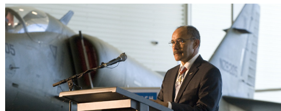
Storage and repair of Canterbury's cultural collections is funded by the Appeal Trust and was officially opened by Governor-General, Lt Gen Rt Hon Sir Jerry Mateparae last month at the Air Force Museum in Wigram.